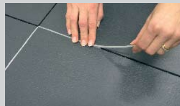
Joint strips for indoor use only