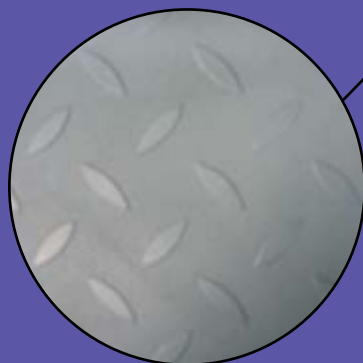
Slip resistant structure